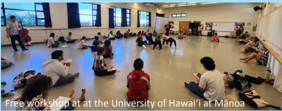
Free workshop at at the University of Hawai'i at Mānoa