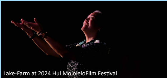
Lake-Farm at 2024 Hui Mo'olelo Film Festival